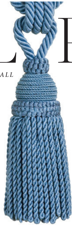
3 BRUNSCHWIG & FILS Coeur tieback in Canton Blue; to the trade. kravet.com