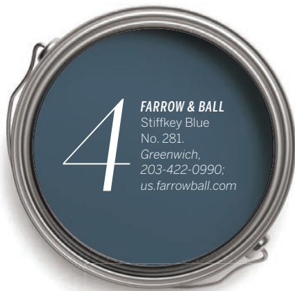
4 FARROW & BALL Stiffkey Blue No. 281. Greenwich, 203-422-0990; us.farrowball.com

I JUST USED STIFFKEY BLUE IN A LIBRARY ON NANTUCKET. IT IS BEAUTIFUL AND HANDSOME, RICH YET BRIGHT. LIKE SO MANY IN THE FARROW & BALL COLLECTION, IT HAS A COMPLEXITY THAT TRANSFORMS IT FROM ONE SIDE OF THE ROOM TO THE OTHER.