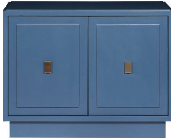
2 VANGUARD FURNITURE Manning side table in Benjamin Moore's Hale Navy; $2,817. Safavieh, Stamford, 203-327-4800; safavieh.com