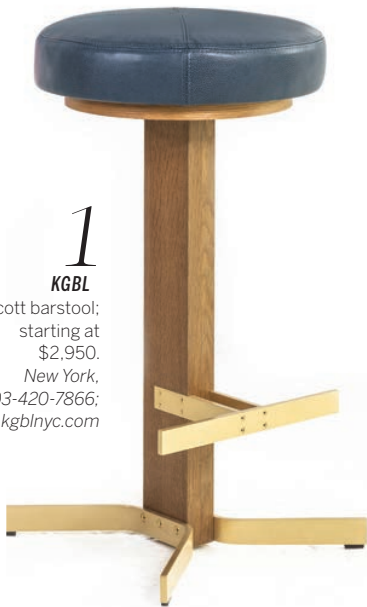
1 KGBL Walcott barstool; starting at $2,950. New York, 203-420-7866; kgblnyc.com